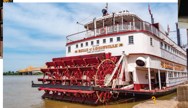
Belle of Louisville