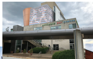
Muhammad Ali Center