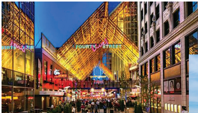
Fourth Street Live!

5:00 p.m. - 6:30 p.m. Welcome Reception (provided by NAPPA)