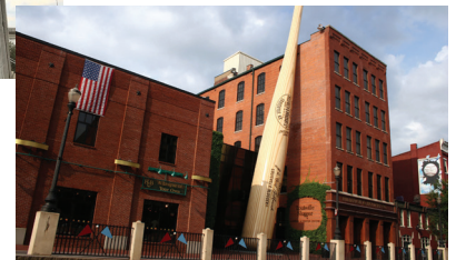
Louisville Slugger Museum